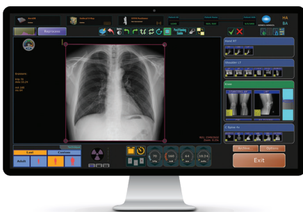
ULTRA Image Acquisition Software