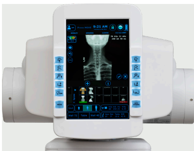
State-of-the-art imaging software supports detailed bone and soft tissue visualization.